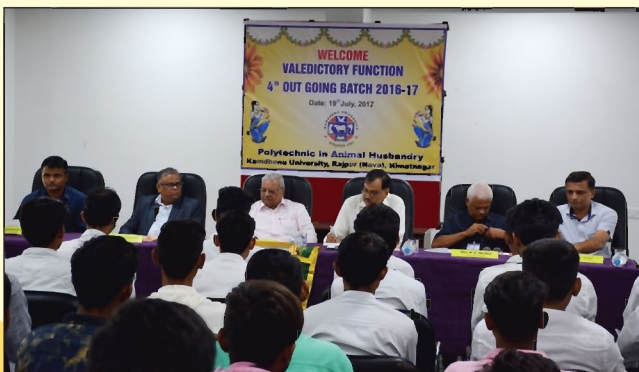
Valedictory Function for the Fourth Out Going Batch