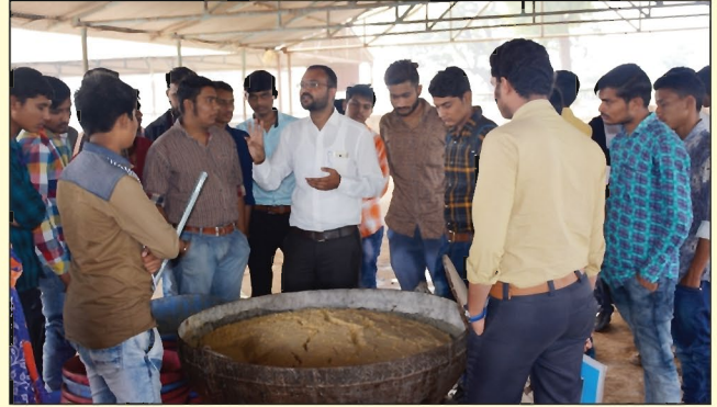
Demonstration of feed preparation for animals