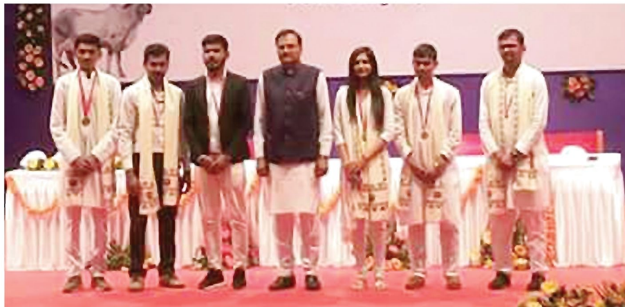
Medalist at Fourth Convocation