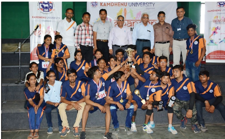
General Championship in Inter Polytechnic Sports Competition