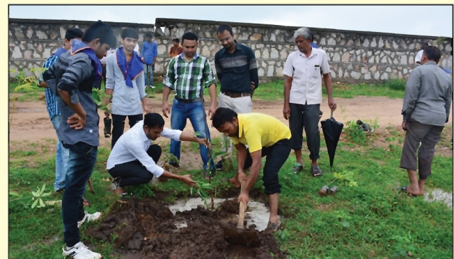
Tree Plantation Programme