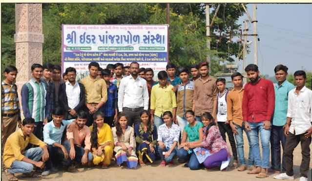
Visit of Shri Idar Panjrapole Sanstha, Idar