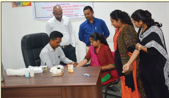
Thalessemia testing & awareness programme