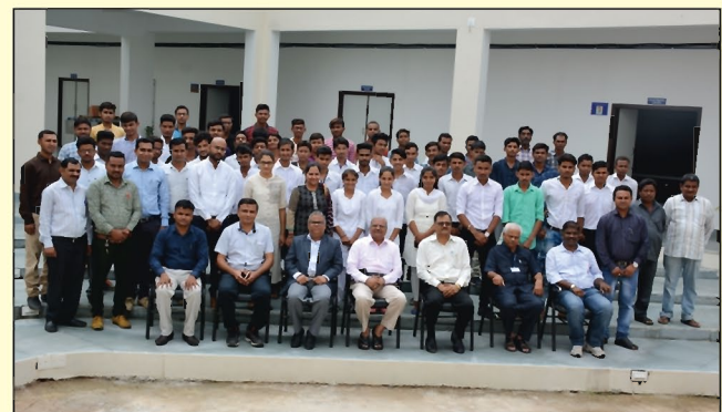
Fourth Out Going Batch