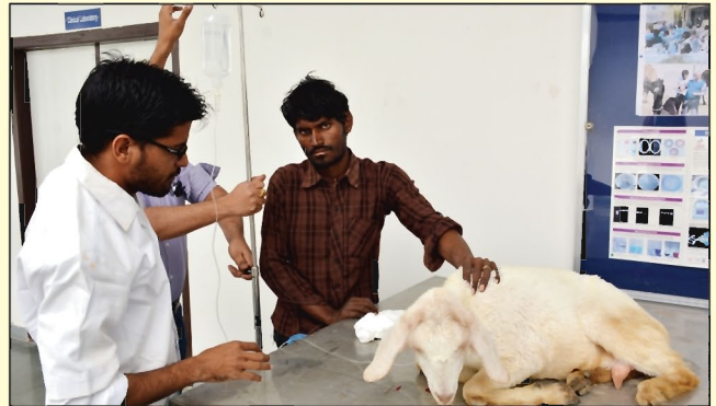
Small Animal Treatment at Polytechnic