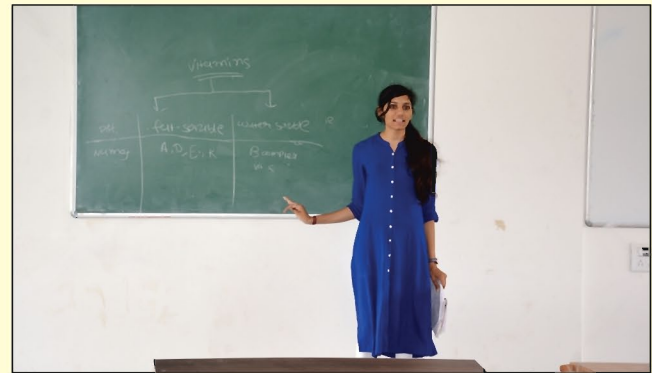
Teachers' Day Celebration