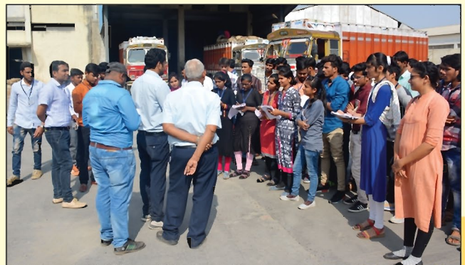
Visit of Sabar Feed Factory, Himmatnagar