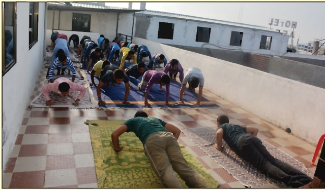
Celebration of International Yoga Day