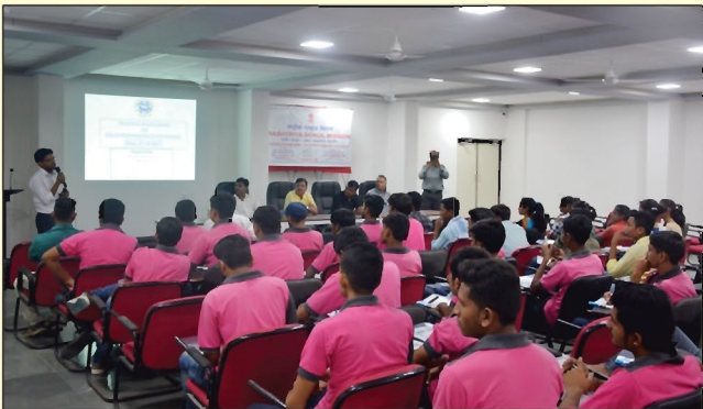
Training Programme on Field Performance Recording