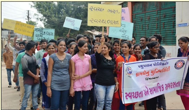
Swachhta Hi Sewa Campaign