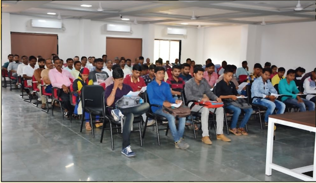
Orientation Programme for the Newly Admitted Students