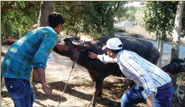
Animal Vaccination Camp