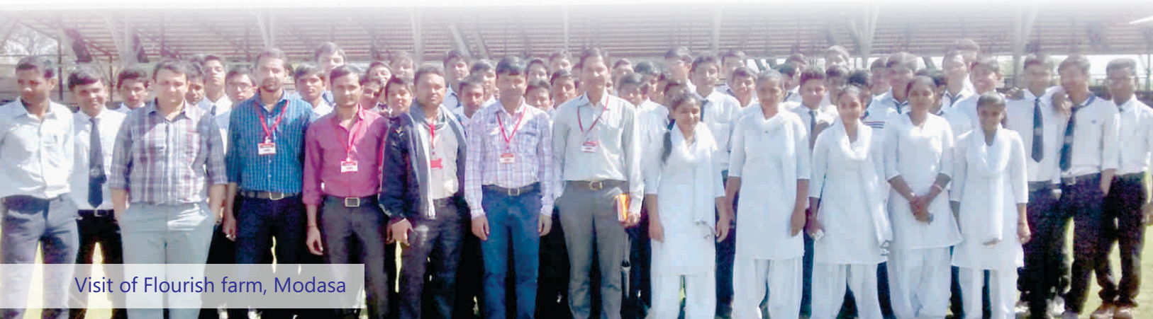
Visit of Flourish farm, Modasa