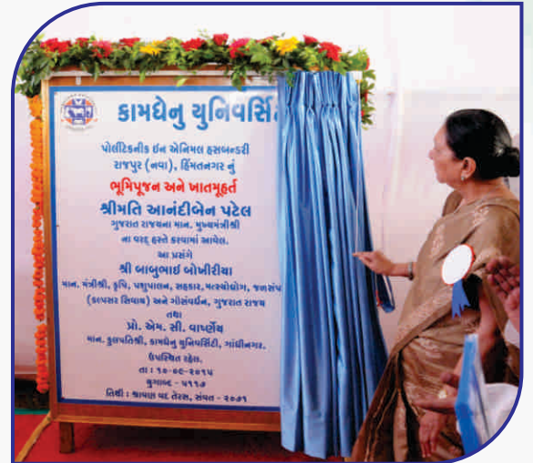
Bhoomi Poojan of PAH Building at Rajpur (Nava), Himmatnagar by Smt. Anandiben Patel, Hon'ble Chief Minister of Gujarat.