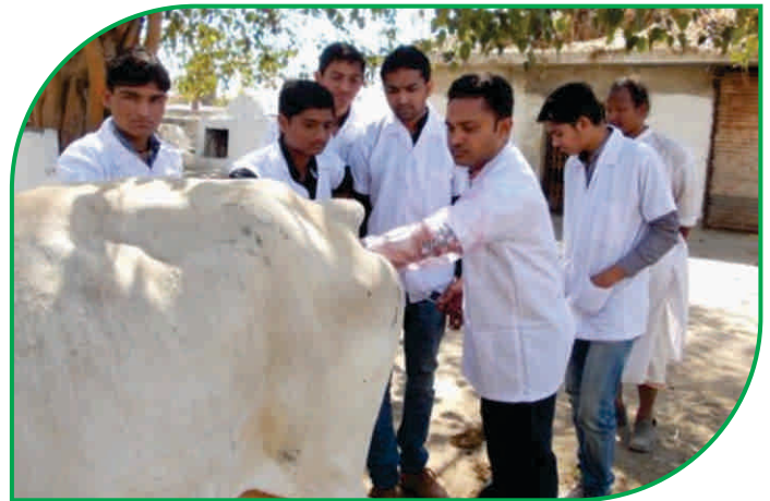
Training at Village Level