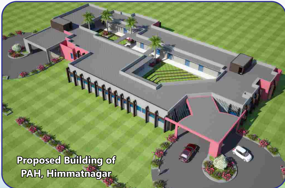
Proposed Building of PAH, Himmatnagar