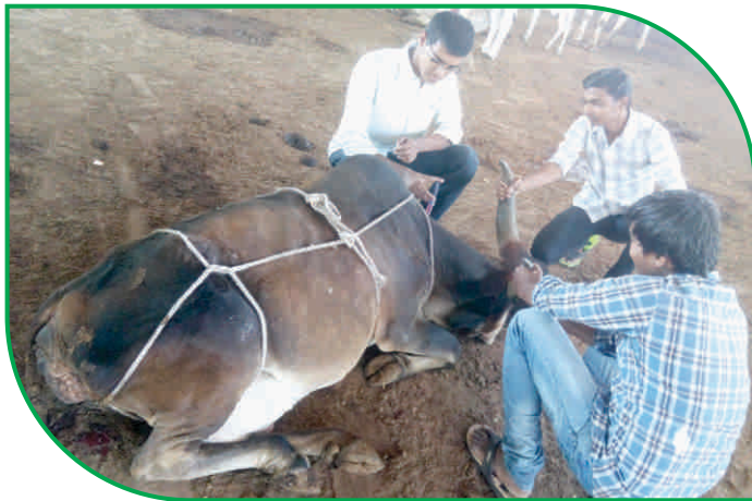
Students Assisting Veterinarian at Polyclinic, Agiyol