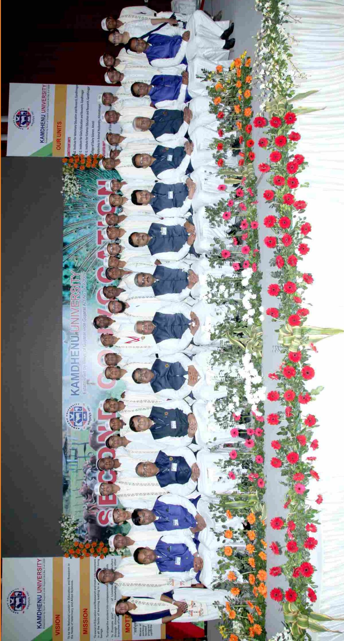
Second Batch of PAH, Himmatnagar at Second Convocation of Kamdhenu University at Mahatma Mandir, Gandhinagar