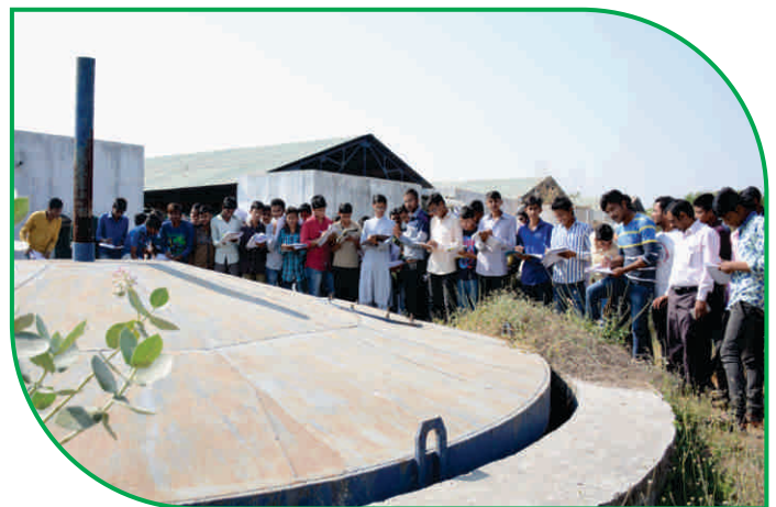
Demonstration of Bio Gas Plant at Animal Hostel, Akodara