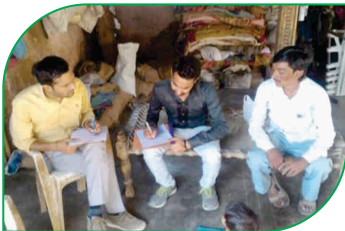
Survey by Staff on Disease Surveillance