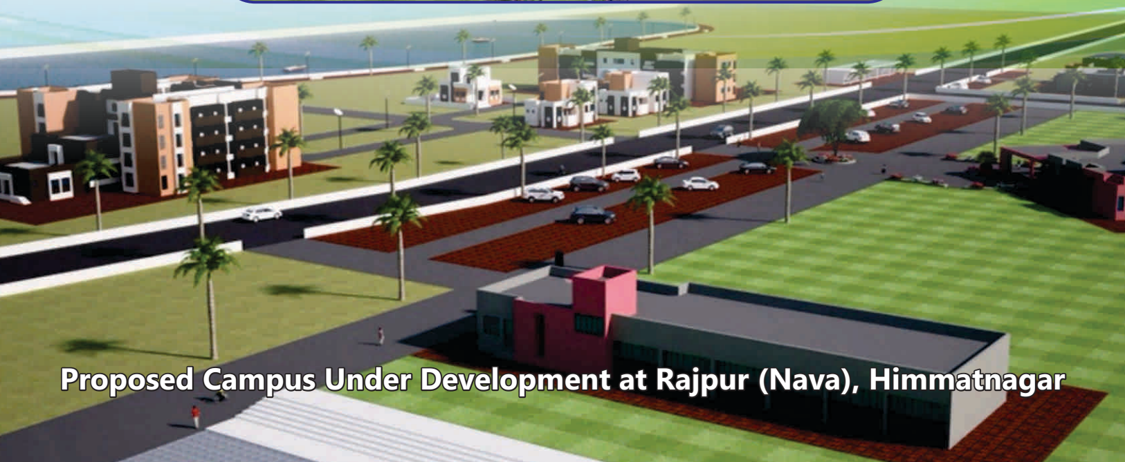
Proposed Campus Under Development at Rajpur (Nava), Himmatnagar