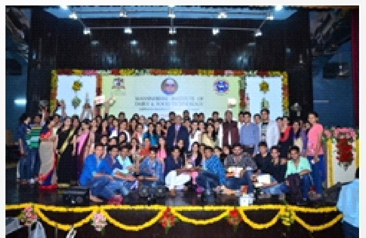
Group photo of MIDFT Family