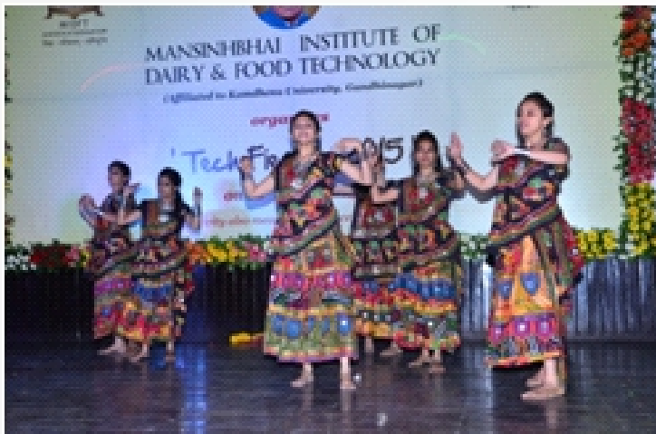
Girls performing Garba dance of Gujarat