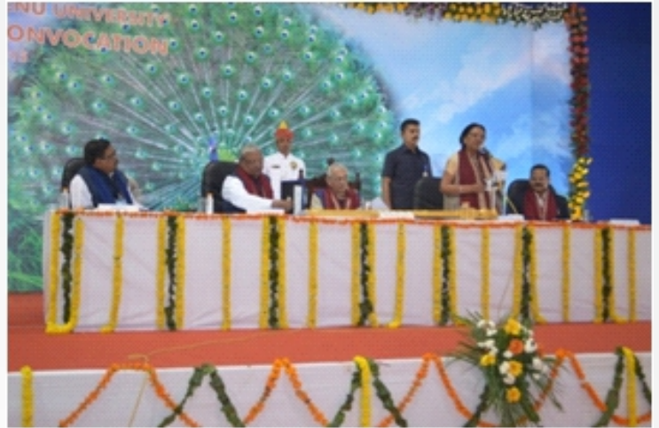
Hon. Chief Minister Mrs. Anandiben Patel delivering convocation address