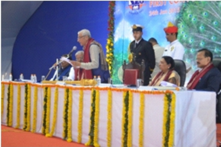
Hon. Governor Shri OP Kohliji delivering presidential address at the convocation