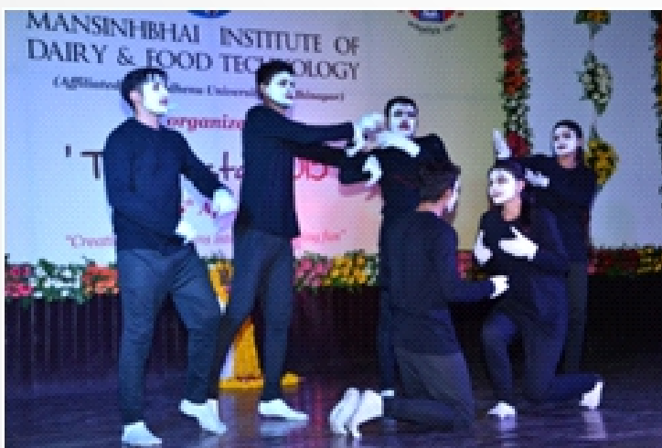
Mime presented by the students