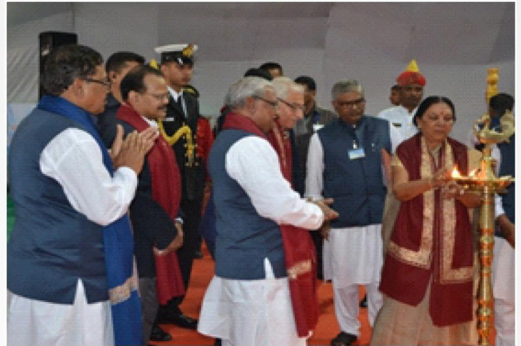
The dignitaries lighting the lamp to inaugurate the convocation