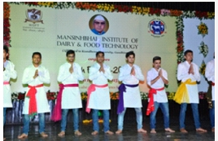
Boys in action at MIDFT