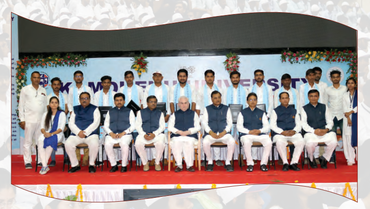
NAVSARJAN PAH, Vijapur