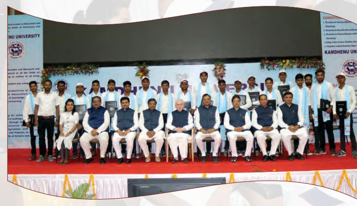
KESHVAM PAH, Chhapi