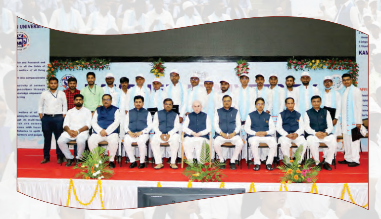
VRUNDAVAN PAH, Jasdan