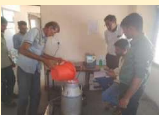
Individual cow milk recording system