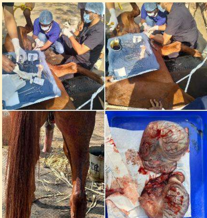
Equine castration with health care

VCC, Bhuj and faculty members of Veterinary Surgery ensuring better surgical management and a healthier future of animal through safe and sterile surgical care.