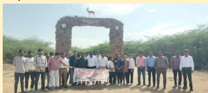
Exposure visit organized for PG students

A one-day exposure visit was organized on 25 th March, 2026 at the Narayan Sarovar Wildlife Sanctuary by the Forest Department, Kutch for the students of the COVSAH, Bhuj with the objective to enhance the educational and practical knowledge of PG students. All PG students and 12 faculty members were actively participated in the Programme. The visit focused on providing field-level exposure to wildlife, biodiversity, and the diverse flora and fauna found in the coastal ecosystem of Kutch district.