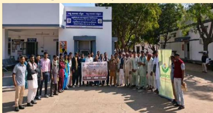
On-campus training programme for farmers