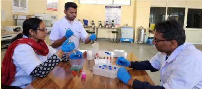
Laboratory examination for diagnosis of Brucellosis disease

At Gadh Shisha village of Mandavi taluka, the faculty of Department of Veterinary Microbiology and Department of Veterinary Pathology jointly collected serum samples with ADIO team and processed for diagnosis of Brucellosis disease.