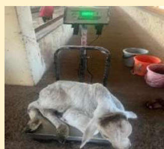
Highest birth weight of a calf- 30 kg (16.01.2026)