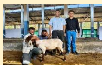
After wool extraction