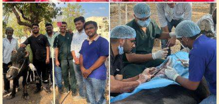
Diaphragmatic Hernia Surgery at VCC