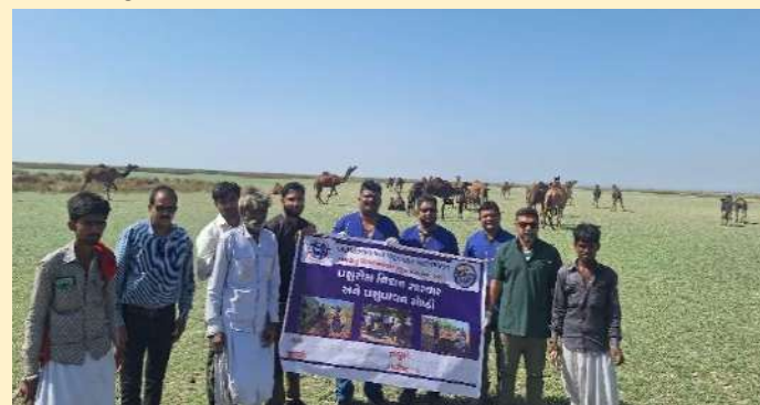
Camel camp at Lushala village in Dwarka district