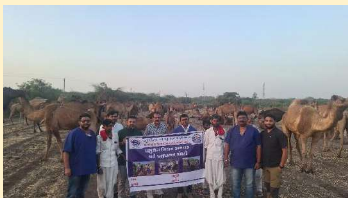
Camel camp at Kharedi Village, Dist. Jamnagar