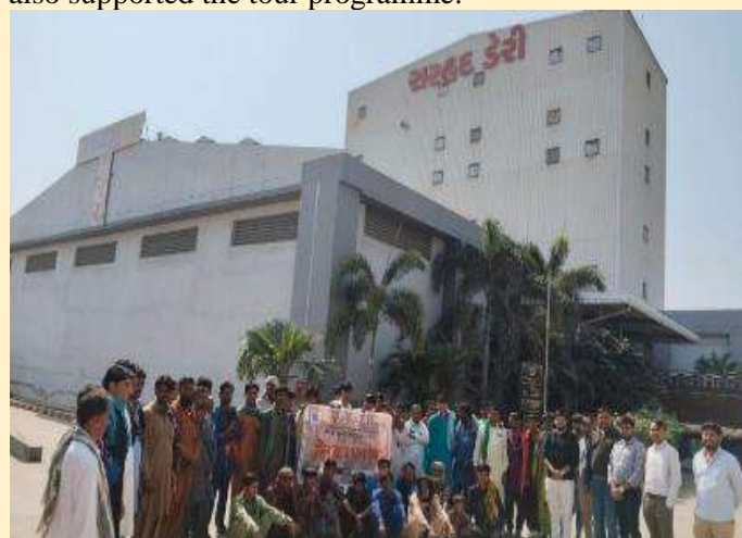
Exposure visit to Sarhad Dairy