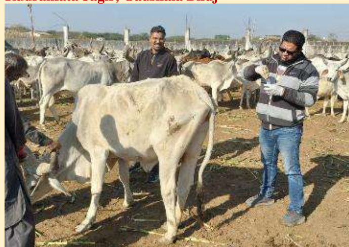
Blood sample collection by faculty members