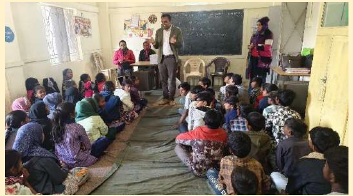
Celebration of National Youth Day in school