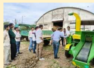
Chaff cutter started at LFC

This research based development success is the result of the great efforts and teamwork of the entire faculties of various disciplines working at LFC campus- Animal Nutrition, Livestock Farm Complex, Animal Genetics & Breeding, Veterinary Microbiology & Veterinary Pathology. A real-time individual cow milk recording system integrated with a milk composition analyzer has been installed at the Livestock Farm Complex (LFC), Bhuj, for automated recording of milk yield and milk composition parameters.