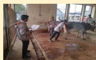
Highest milk production- 421 liters/day