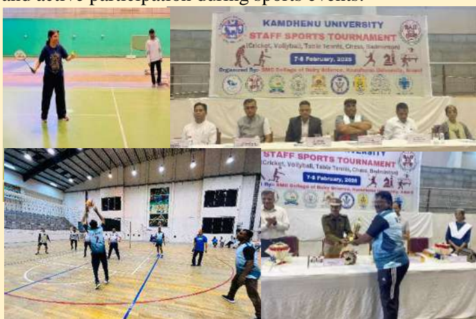
Active participation of staff members in sports