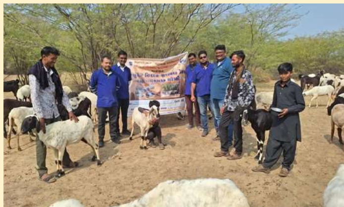
Veterinary Clinical Camp for sheep & goats