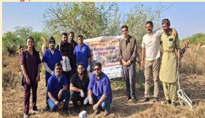
Clinical camp for camels