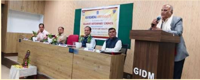
Principal & faculty participation in workshop