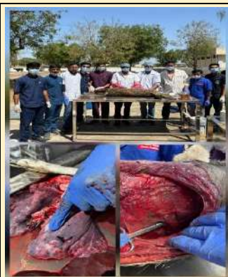
Post-mortem of Spotted Deer of Cheetah Conservation Centre, Banni, Bhuj. (Severe tubercle like nodules)