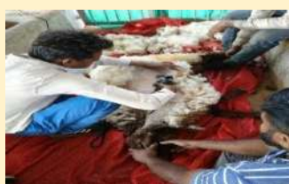
Sheep wool shearing