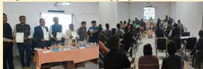
Glimpses of the training programme organized at Bhuj