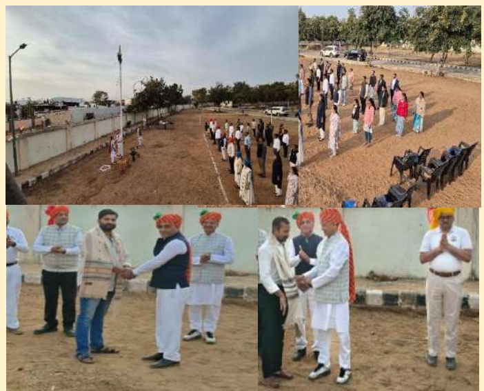
Celebration of Republic day at COVSAH, Bhuj campus