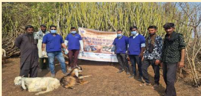
Clinical camp for sheep and goats