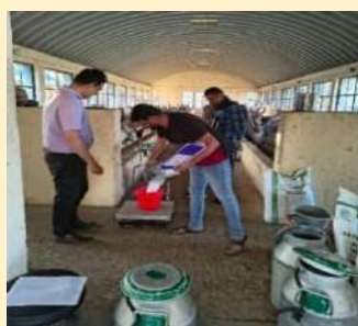
Individual milk recording started at LFC