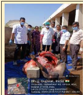
Post-mortem of Buffalo at Buffalo Breeding Farm, Bhuj (Acute Respiratory Distress)