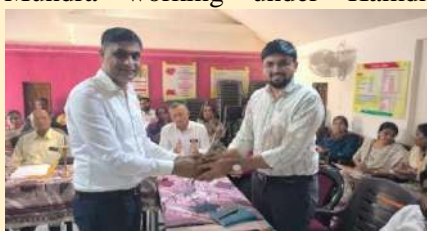
SAC meeting at KVK, Mundra