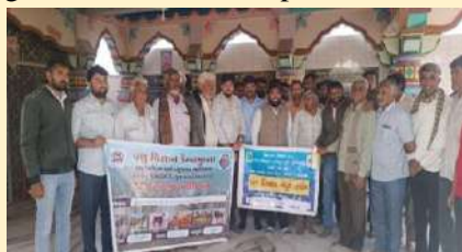
Camp and field visit for farmers