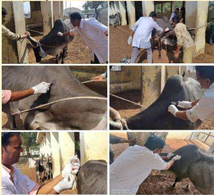
Active involvement of faculty members in TB & JD screening

The faculty members of Dept. of Veterinary Pathology, Veterinary Microbiology and Livestock Farm Complex were actively involved in TB, JD screening of farm animal at LFC, Bhuj.