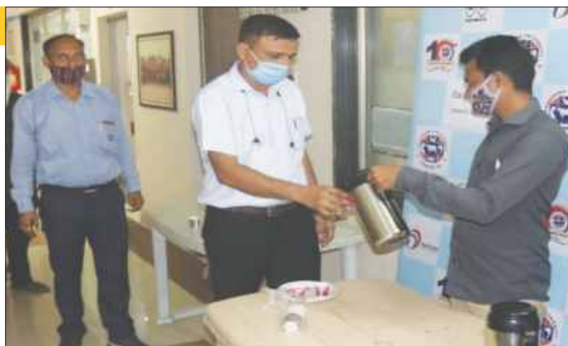
Decoction Distribution for Novel Corona (COVID 19) Prevention

The Corona virus pandemic has been spread around the world this year. Kamdhenu University arranged Novel Corona (Covid 19) prevention Decoction Distribution programme as a precautionary measure to improve the immunity of all the University staff from 23 - 29 September, 2020, with the support of Government Ayurvedic Hospital, Sector - 22, Gandhinagar, as a part of Novel Corona Prevention Programme.