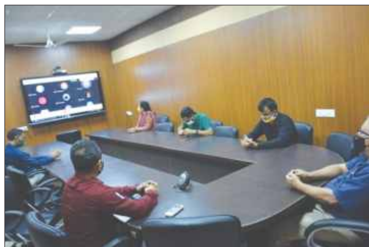
Online Elocution Competition