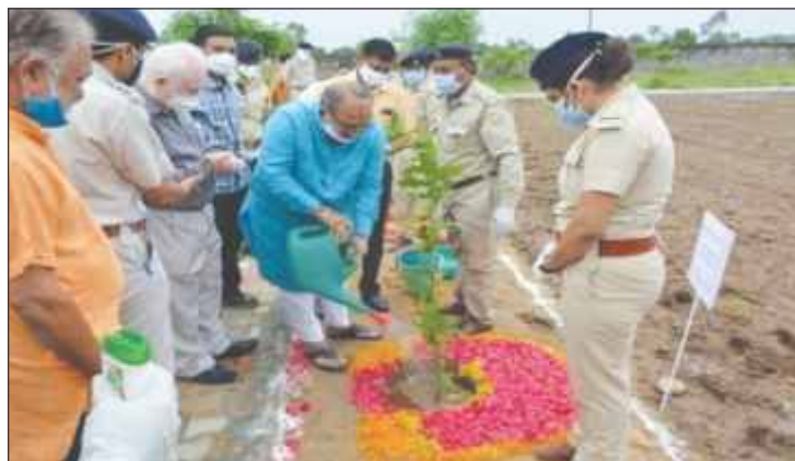
Van Mahotshav Celebration at Rajpur Campus