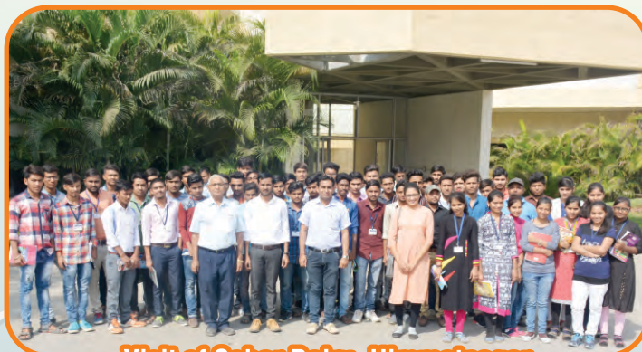
Visit of Sabar Dairy, Himmatnagar