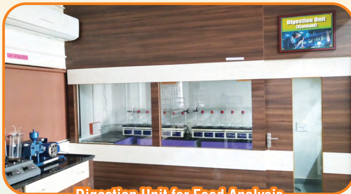
Digestion Unit for Feed Analysis