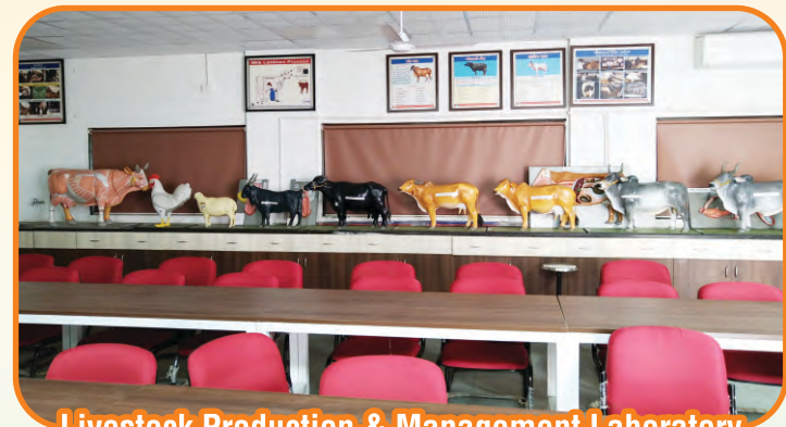
Livestock Production & Management Laboratory