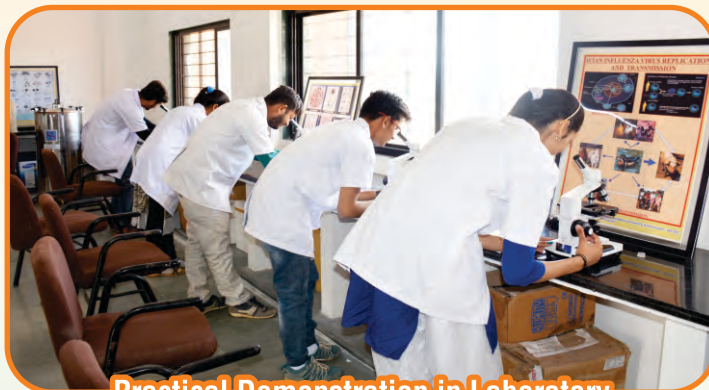
Practical Demonstration in Laboratory