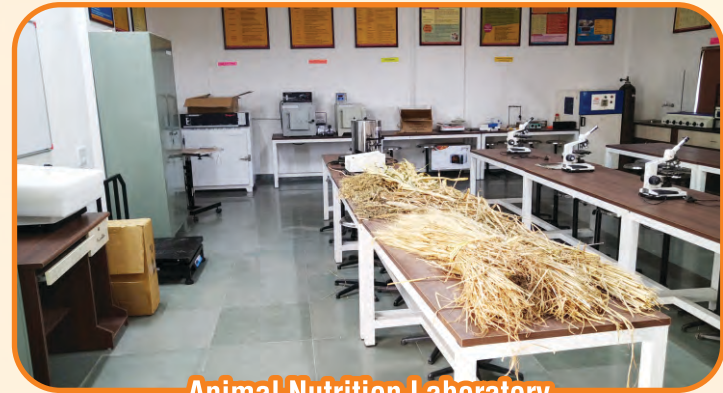
Animal Nutrition Laboratory