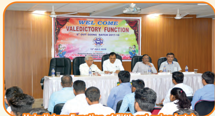
Valedictory Function of Fifth out going batch