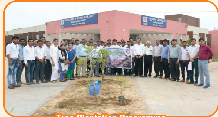
Tree Plantation Programme