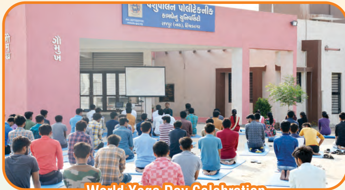
World Yoga Day Celebration