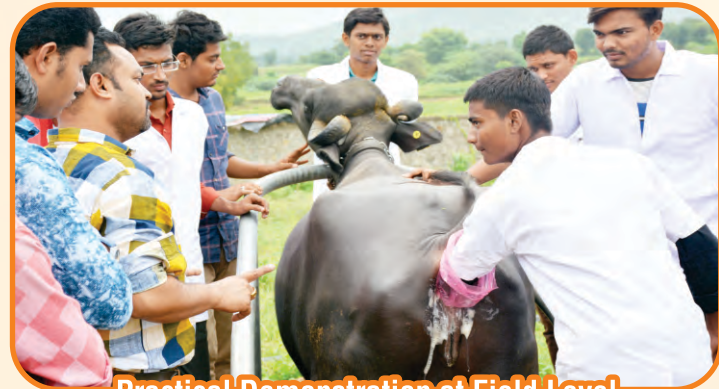
Practical Demonstration at Field Level