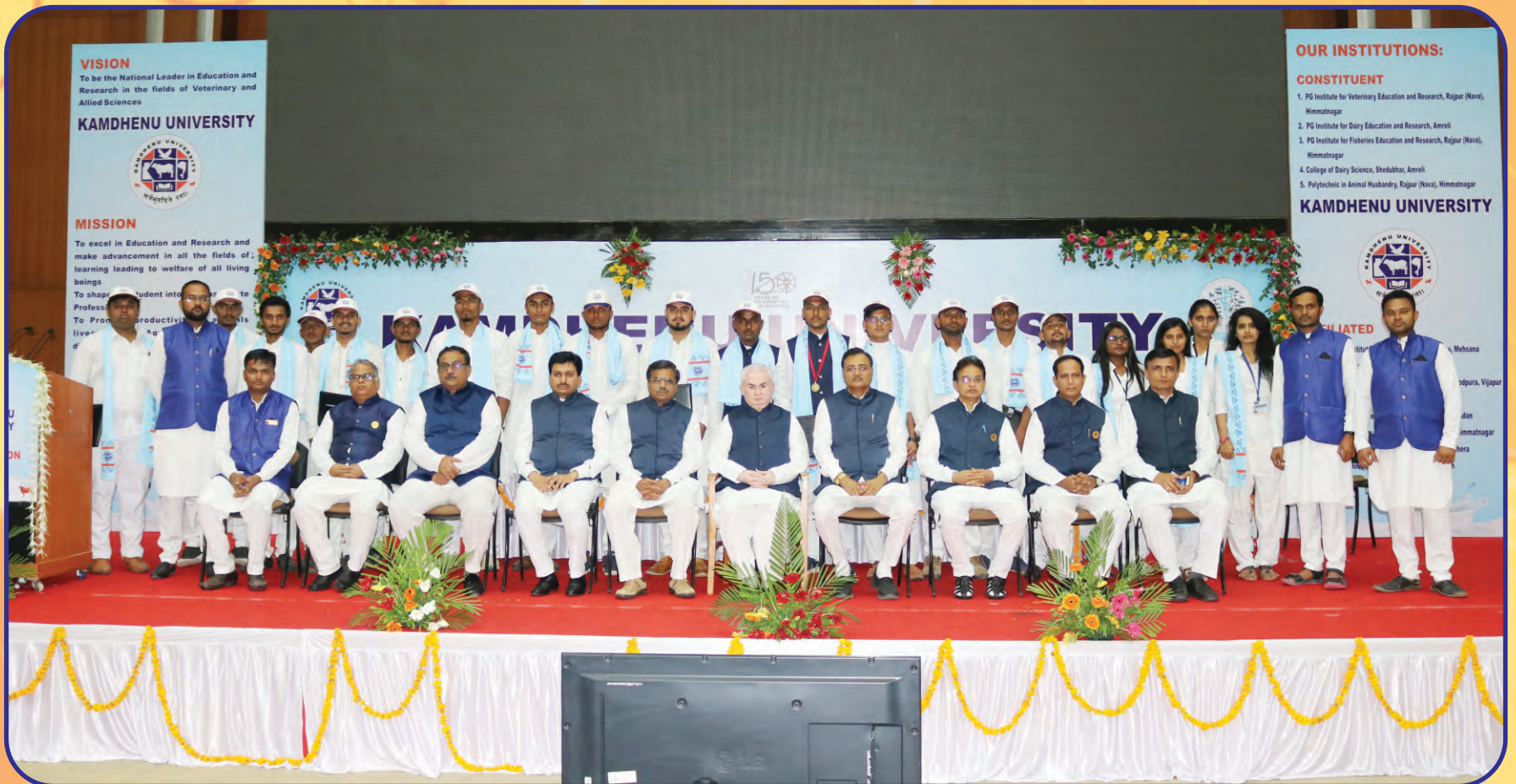
Fifth Out Going Batch of PAH, Rajpur (Nava), Himmatnagar