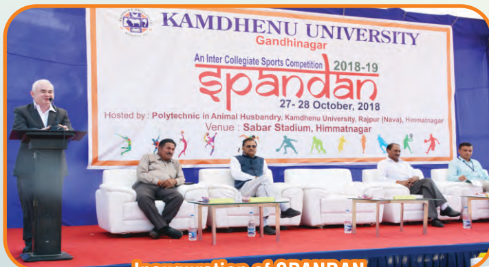
Inauguration of SPANDAN