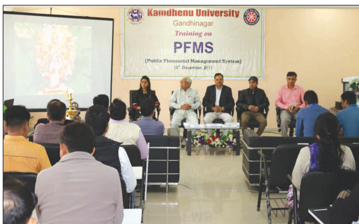
Inaugural function of PFMS Training Programme