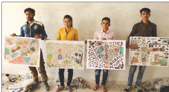
Paper Collage making competition