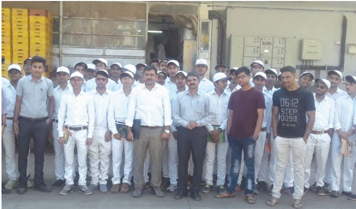
Students of CDS, Amreli at HAVMOR Ice cream plant, Ahmedabad

To give exposure of ice cream industry to 3 rd semester students of College of Dairy Science, an educational study visit to HAVMOR Ice cream, Ahmedabad was arranged on 23 rd November, 2017.