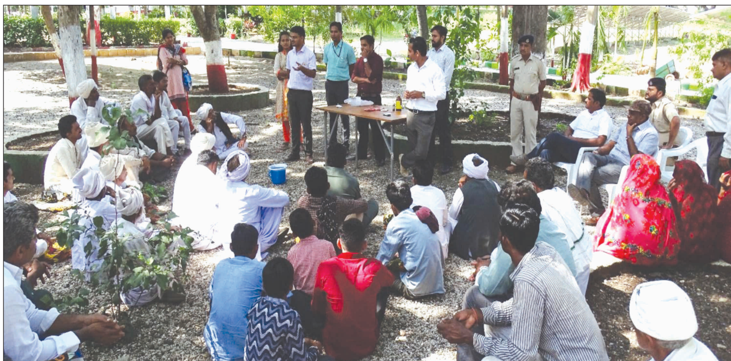
Group Demonstration of various Scientific Animal Husbandry Techniques to Trainees at Sasan