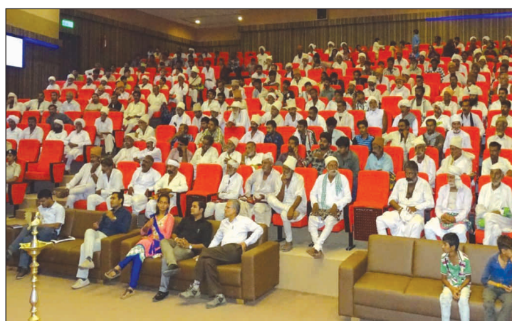
Participants in Maldhari Training Programme at Sasan Gir