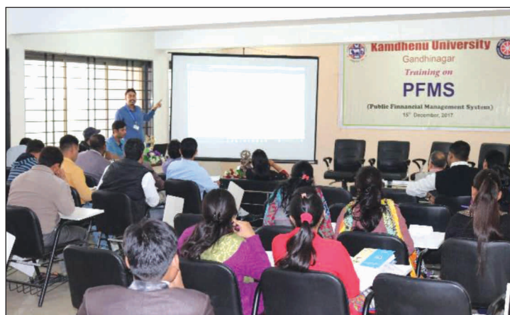
Presentation by Experts