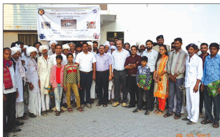
Participants with officers of Dept. of Forest and Kamdhenu University