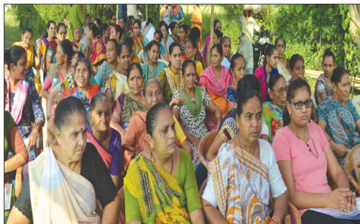
Dairy Farm women at training programme at Shekhdi, Ta: Petlad, Dist. Anand