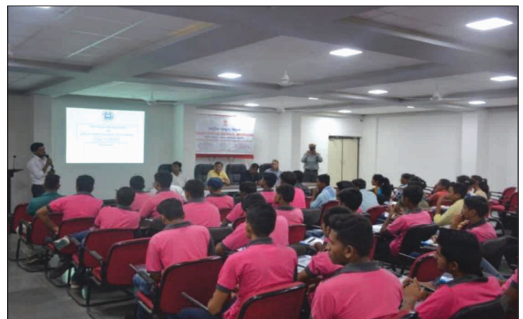
Participants of training programme on field performance recording at Rajpur