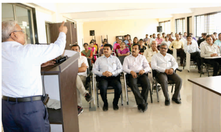
Vichar Manthan on 4/8/ 2017