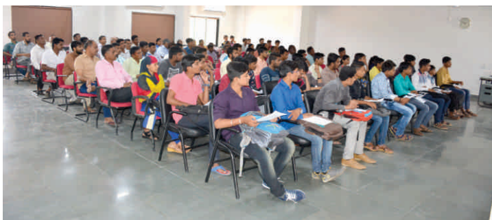
Newly admitted students of PAH, Rajpur (Nava) in orientation programme

Polytechnic in Animal Husbandry, Rajpur (Nava) organized an orientation programme for the fresh admitted students at the Polytechnic premises on 4th August 2017. The major objective of the programme was to make the parents and students aware of the academic aspects of the course, the rules and regulations of the polytechnic and ensuring parental participation in monitoring the performance and progress of the students.