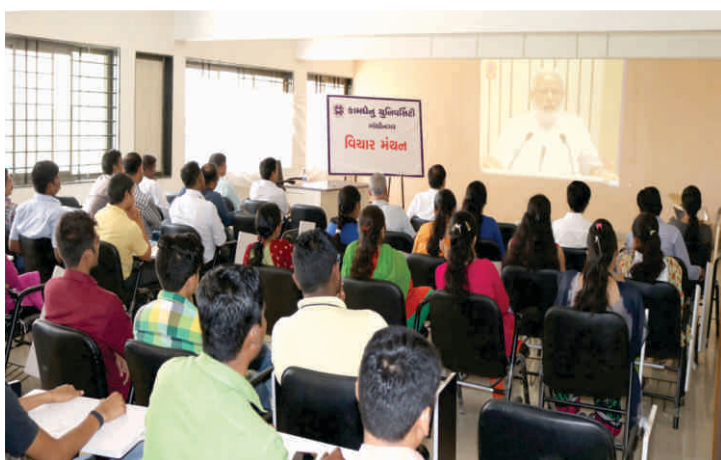
Online address of Shri Narendra Modi, Hon. Prime Minister of India

On the occasion of Pandi Deendayal Upadhyaya's Centenary Celebration and 125th Anniversary of Swami Vivekananda's address at the Chicago world parliament religions, the Hon. Prime Minister Shri Narendra Modi online addressed youth on 11th September, 2017. The KU officers, staff and students participated. The theme of the programme was "Young India, New India - A Resurgent Nation: from Sankalp to Sidhhi".