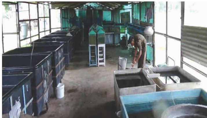
Wet Lab Facility at Prantij Farm