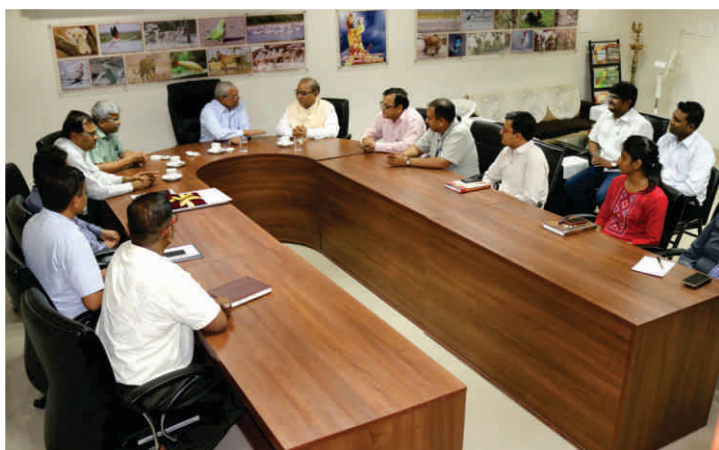
Monthly Review meeting on 3/7/2017