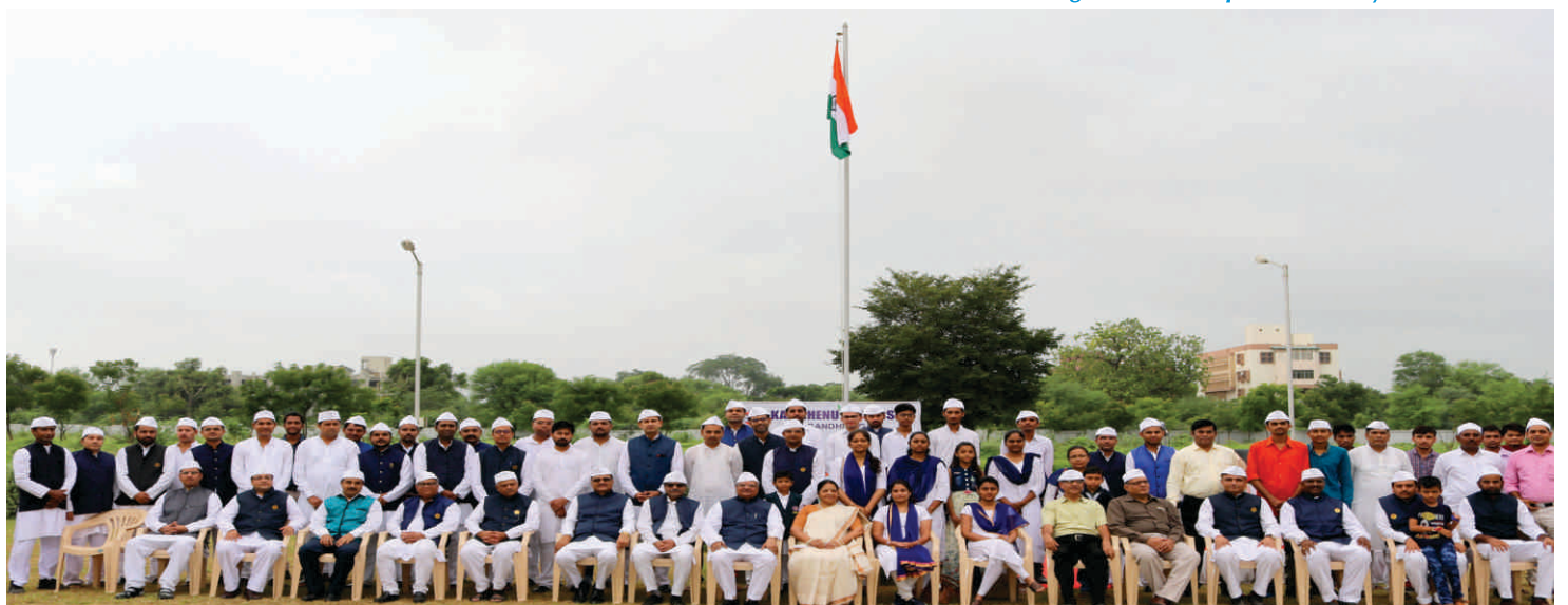
The KU family on 71st Independence Day Celebration