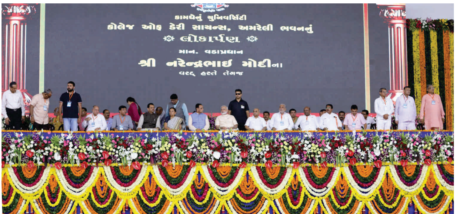
Inauguration of Dairy Science College by Shri Narendrabhai Modi, Hon. Prime Minister, India, Shri Vijaybhai Rupani, Chief Minister, Gujarat, ministers of cabinet and other dignitaries.