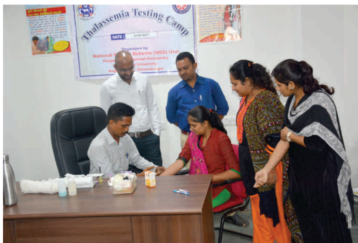
Thalassemia testing camp at PAH, Rajpur (Nava)

A Thalassemia testing and awareness programme for newly admitted students of Polytechnic in Animal Husbandry, Rajpur, (Nava), Himmatnagar was organized on 20th September, 2017 with the collaboration of Indian Red Cross Society, Ahmedabad. The objective was to spread the awareness about causes and remedies of Thalassemia. Total 40 students of first semester (Male-33 and Female-7) were screened for Thalassemia in this camp.