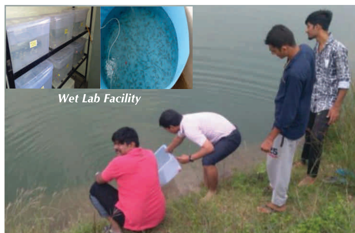
Wet Lab Facility