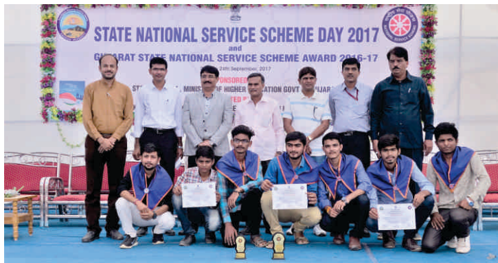
Programme officers and team managers along with winners of elocution competition