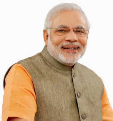
Shri Narendrabhai Modi Hon'ble Prime Minister

Envisioned the dream of Kamdhen University and laid its foundation by Gujarat Act No. 9 of 2009