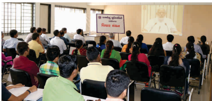
Vichar Manthan on 11/9/2017