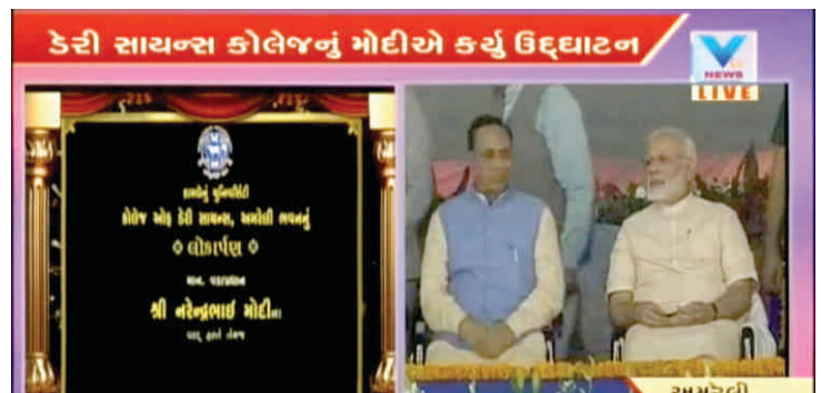
Hon. Prime Minister Shri Narendra Modi inaugurated the newly constructed building of college of Dairy Science of KU on 17th September, 2017