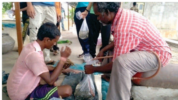
Fish seed packaging

technique of Indian Major Carp and Indian Catfish using pituitary gland extract practically demonstrated. Also fish seed packaging for transportation was practically performed by them.