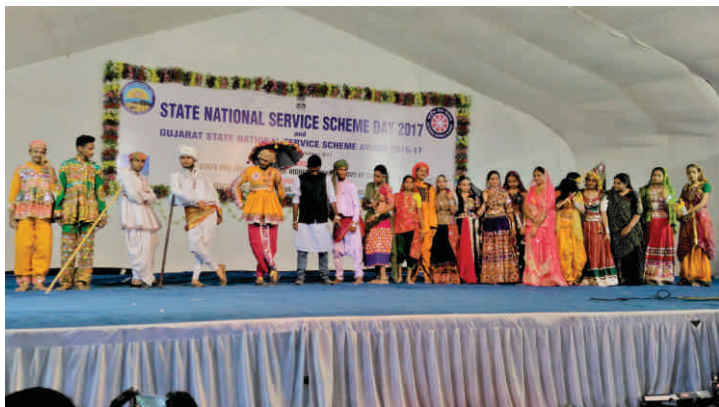
Students of CDS, Amreli and MIDFT, Mehsana in NSS day celebration at Bhuj-Kachchh

Kamdhenu University participated in National Service Scheme Day Celebration hosted by Krantiguru Shyamji Krishna Verma University, Bhuj-Kachchh during 22nd to 24th September 2017. Around 550 NSS Volunteers including KU were from 25 different Universities participated in this Event.