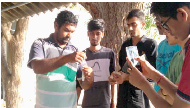
Pituitary gland extract preparation for Induced breeding

M. F. Sc. Aquaculture Students of KU had visited Kutch Vikas Trust, Bhuj, during 4th - 5th September, 2017. They were benefited about induced breeding