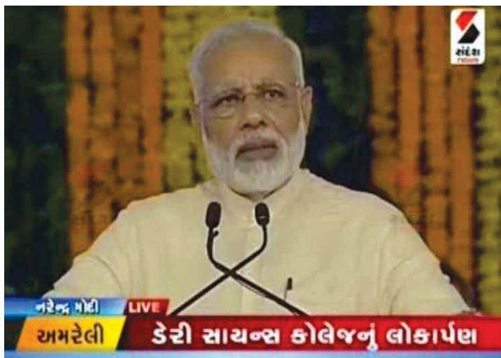
Hon. Prime Minister Shri Narendra Modi addressing audience on the occasion of inaugural function of CDS, Amreli