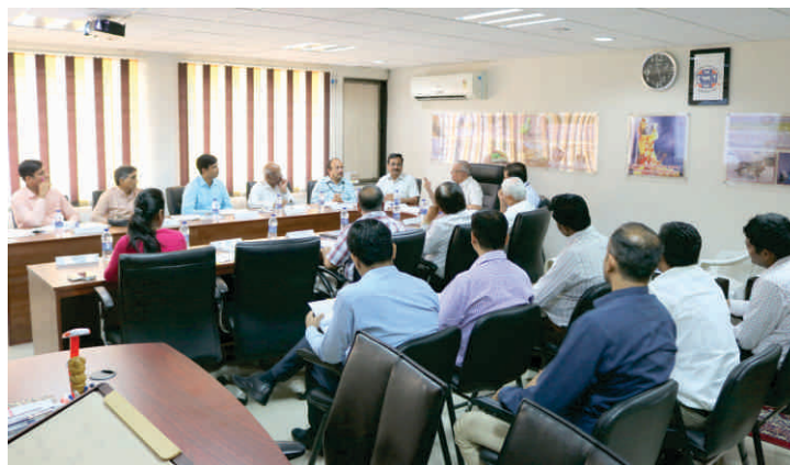
Second meeting of the NSS advisory committee