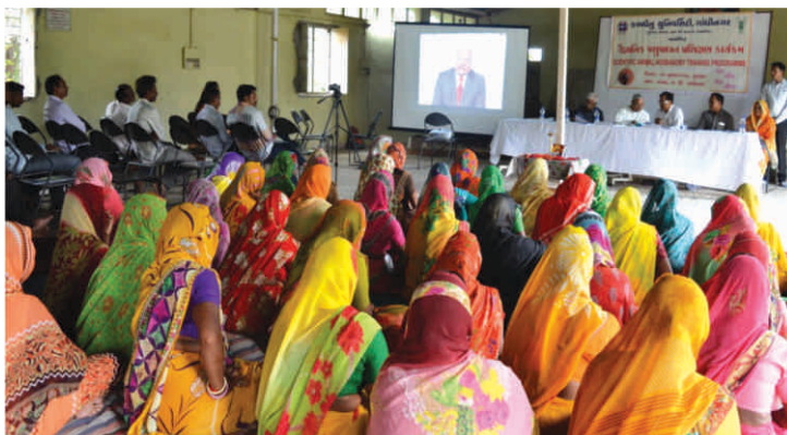
Dairy farm women attending training programme at Vasan