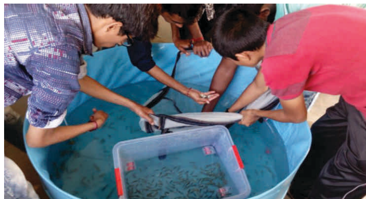
Fish Seeds segregation for release in pond

KU, Gandhinagar has moved one step ahead in development of research facilities at Fisheries Research Station, Nava Rajpura, Himmatnagar. First time fish seeds of Indian major carp and Tilapia were stocked in newly constructed pond. Further, wet lab facilities were also developed with different size of tanks, field laboratory and 24×7 aeration facility to support research work. Breeding and rearing of ornamental fishes such as Sword tail, Pearl Gourami and Guppy is initiated and performed successfully.