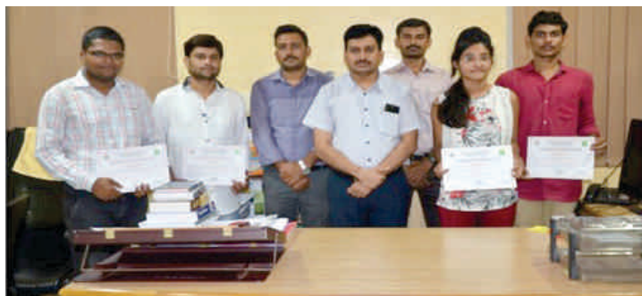
Students of CDS, Amreli in National Dairy Product Judging Quiz Contest