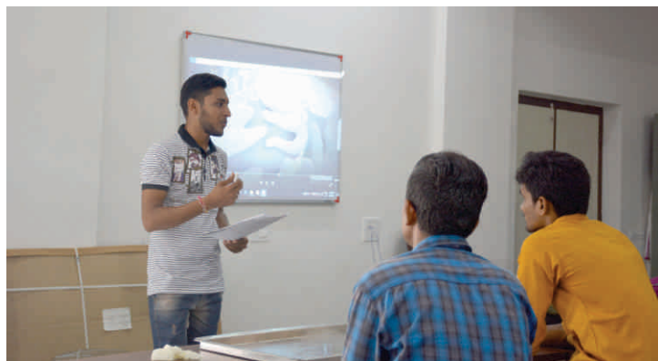
Teachers day celebration at PAH, Rajpur (Nava)