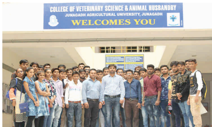
Students of PAH, Rajpur (Nava) visited college of veterinary science and A.H., Junagadh during educational tour