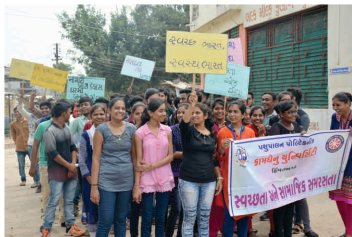
Rally by students of PAH, Rajpur (Nava) to create awareness regarding benefits of hand washing at Rajpur (Nava) village.

Polytechnic in Animal Husbandry, Rajpur, (Nava), Himmatnagar has organized Swachhta Hi Sewa campaign during 15th September, 2017 to 2nd October, 2017 by organizing various activities such as rally with placards to create awareness on benefits of Hand Washing at Rajpur (Nava) village.