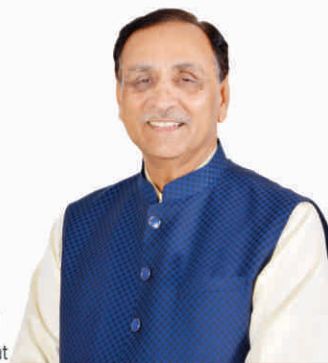
Shri Vijaybhai Rupani Hon'ble Chief Minister of Gujarat

Envisioned the dream of Kamdhen University and laid its foundation by Gujarat Act No. 9 of 2009