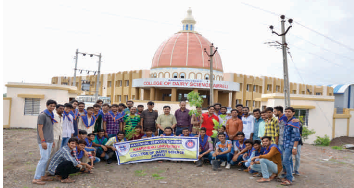
Tree plantation at CDS campus Shedubhar, Amreli.