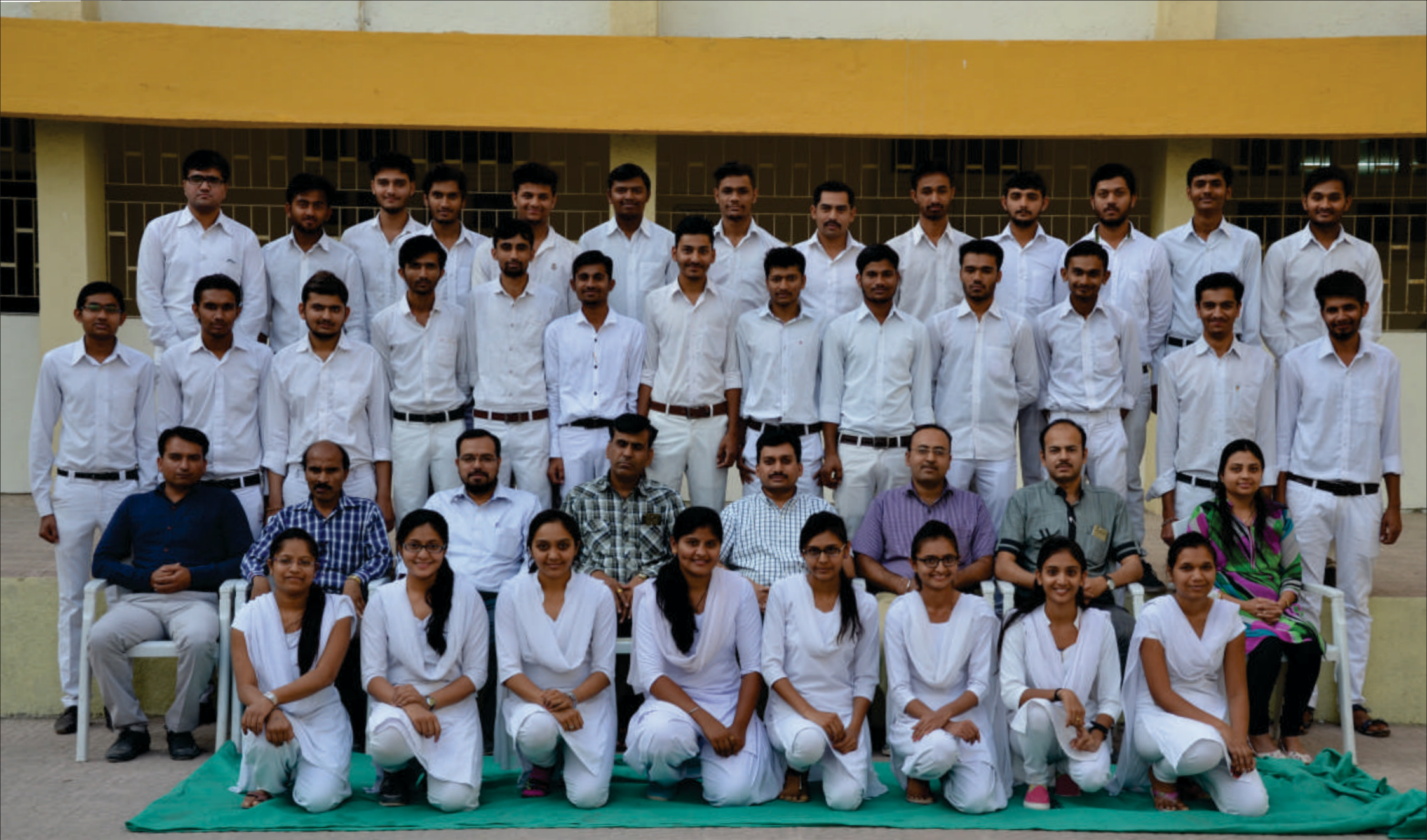
Outgoing Batch (2012-16) with Staff members